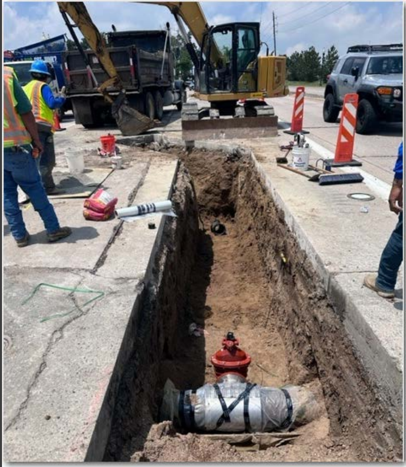
12" x 8" Tapping Sleeve and Valve