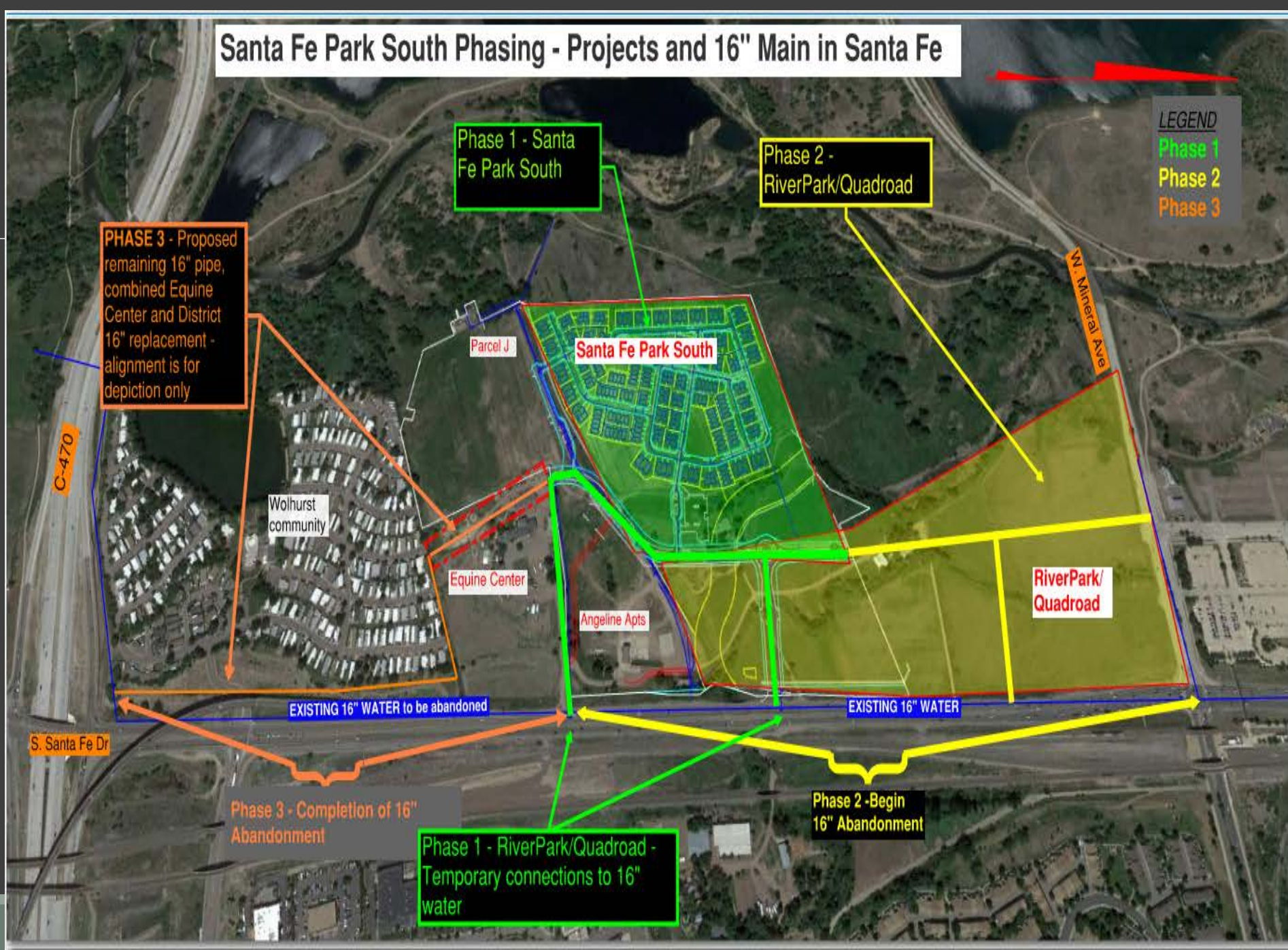
Santa Fe Park South Phasing - Projects and 16" Main in Santa Fe

The 2024 SWM 16" replacement extends from C-470 north to the Equine Center property to the new Platte River Parkway – new 16" transmission main. Thus abandon all 16" pipe in S. Santa Fe