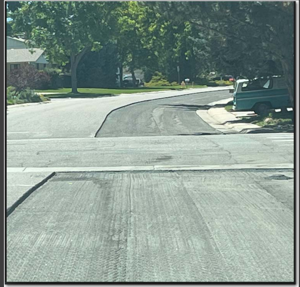
Paving on Elmhurst at Newland - 6/21/23

2023 Budget for project (includes design and contingency $868,735.00)